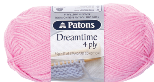
Dreamtime Merino 4 ply 100% Merino Wool

Assistline (Melbourne, Australia.) +61 3 9380 3888