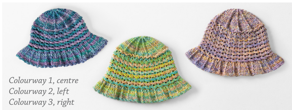
Colourway 1, centre Colourway 2, left Colourway 3, right

Yarn over hook, insert hook at front of work from right to left around the post of the required stitch. Complete the treble as usual.