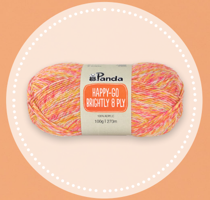
Happy-go Brightly 8 ply