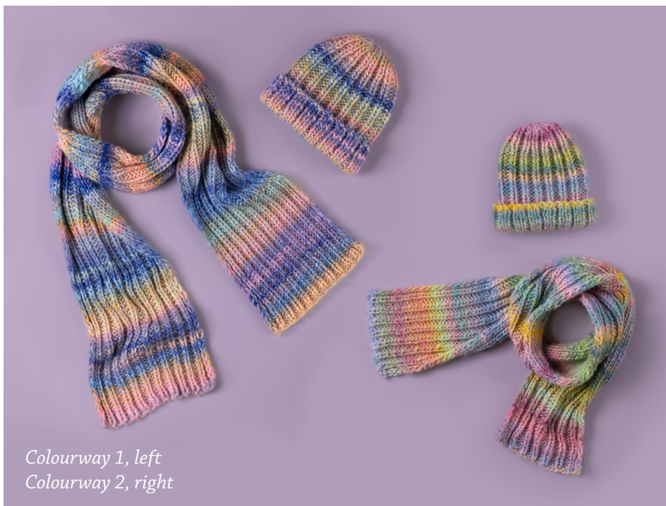
Colourway 1, left Colourway 2, right

Use only the yarn specified. Other yarns are likely to produce different results. Quantities are approximate as they can vary between knitters. Ensure all yarn is from the same dye lot.