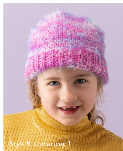
Style B, Colourway 1