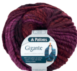
Gigante 53% Wool 47% Acrylic

Assistline Melbourne, Australia. +61 3 9380 3888