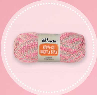
Happy-go Brightly 8 ply