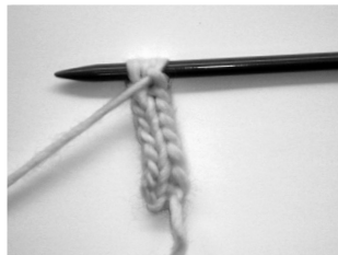
View from back.